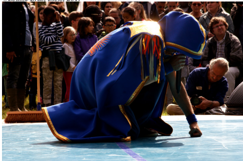
Blois, 2017

He's been also developing his body drumming technique for a few years now.