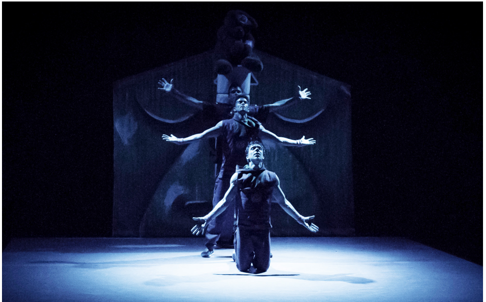
Bruxelles, 2016

In an epoch where the end of times is in the air, they come to open a collective ceremonial space singular and enigmatic, by performing a number of scatty rituals. The audience is occasionally invited to take part to the show by singing, clapping and moving, to celebrate the breathe of life, the universe and the human community.