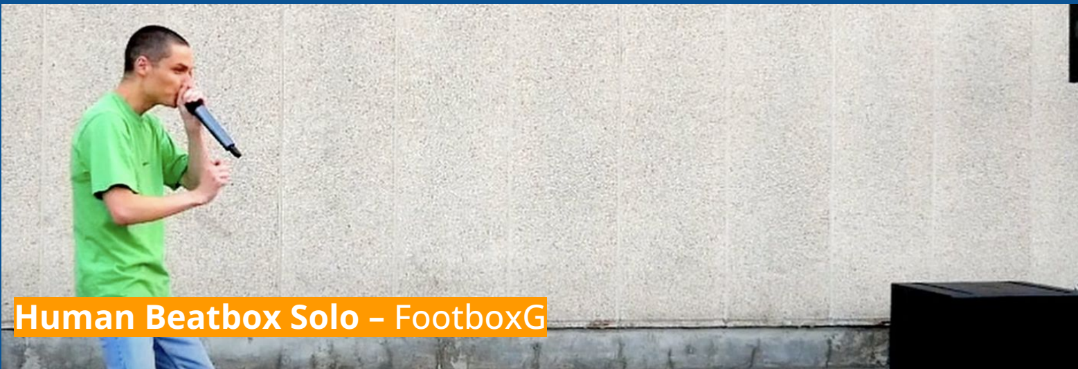
Human Beatbox Solo – FootboxG