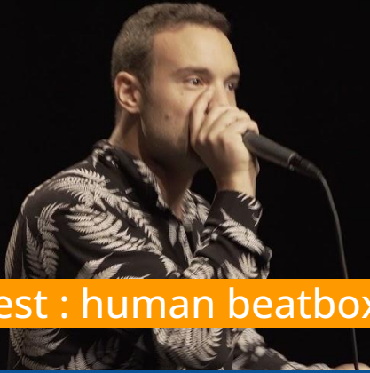
Primitiv + guest : human beatbox performance